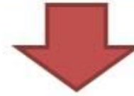
PA-KUA HEMISFERIO NORTE