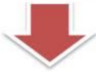
PA- KUA HEMISFERIO SUR